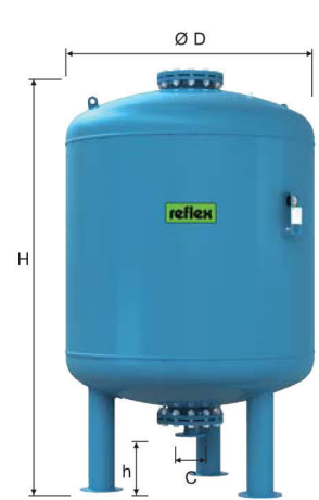
3000 - 5000 Litres