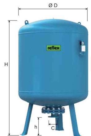
1000 (Ø 1000) - 2000 Litres